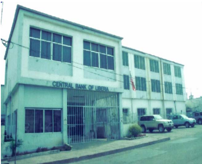
CENTRAL BANK OF LIBERIA

Corner of Warren and Carey Streets P. O. Box 2048, Monrovia Tel: 231-5-960557/5-960556 Fax: (231) 770-59642 Website: www.cbl.org.lr