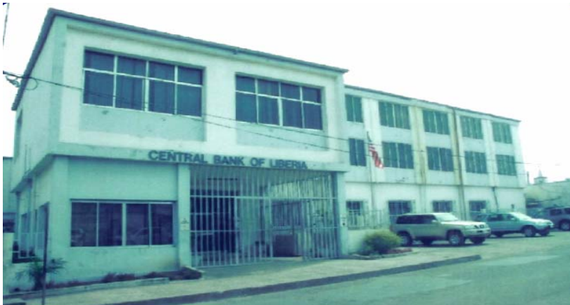
CENTRAL BANK OF LIBERIA