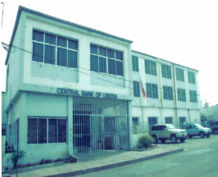
CENTRAL BANK OF LIBERIA