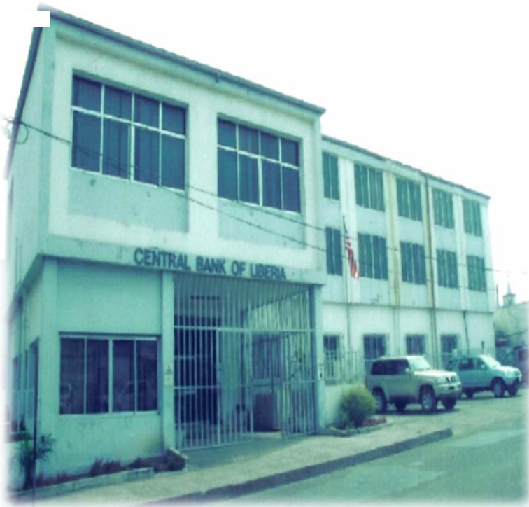
CENTRAL BANK OF LIBERIA