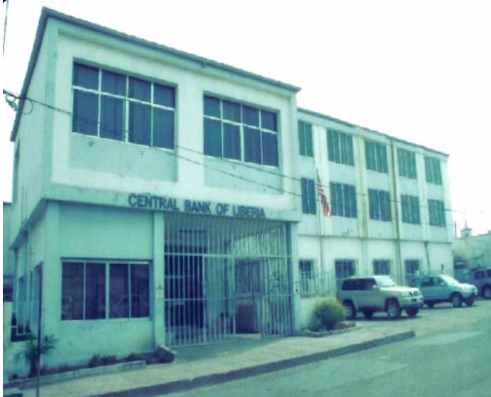
CENTRAL BANK OF LIBERIA

Corner of Warren and Carey Streets P. O. Box 2048, Monrovia Tel: 231-5-960557/5-960556 Fax:(231) 770-59642 Website: www.cbl.org.lr