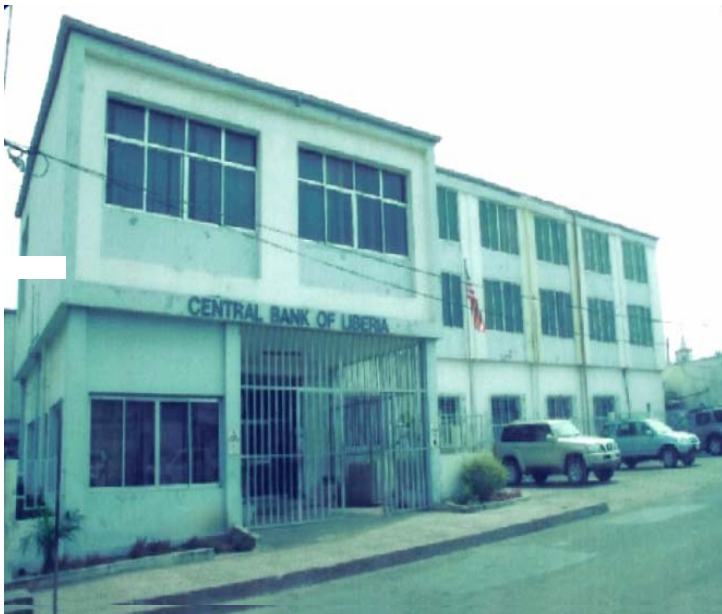
CENTRAL BANK OF LIBERIA