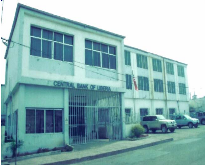
CENTRAL BANK OF LIBERIA

Corner of Warren and Carey Streets P. O. Box 2048, Monrovia Tel: 231-5-960557/5-960556 Fax:(231) 770-59642 Website: www.cbl.org.lr