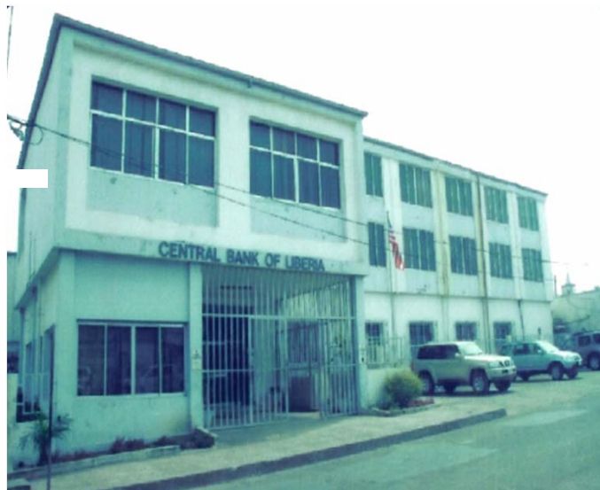
CENTRAL BANK OF LIBERIA