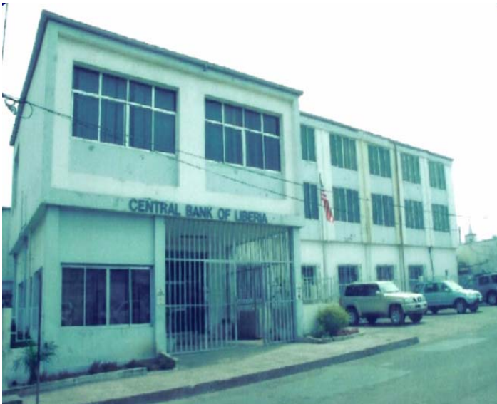
CENTRAL BANK OF LIBERIA

Corner of Warren and Carey Streets P. O. Box 2048, Monrovia Tel: 231-5-960557/5-960556 Fax: (231) 770-59642 Website: www.cbl.org.lr