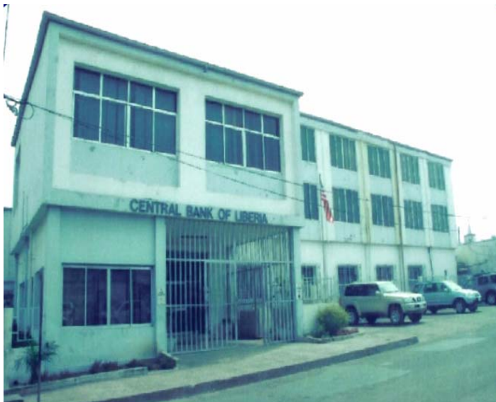
CENTRAL BANK OF LIBERIA