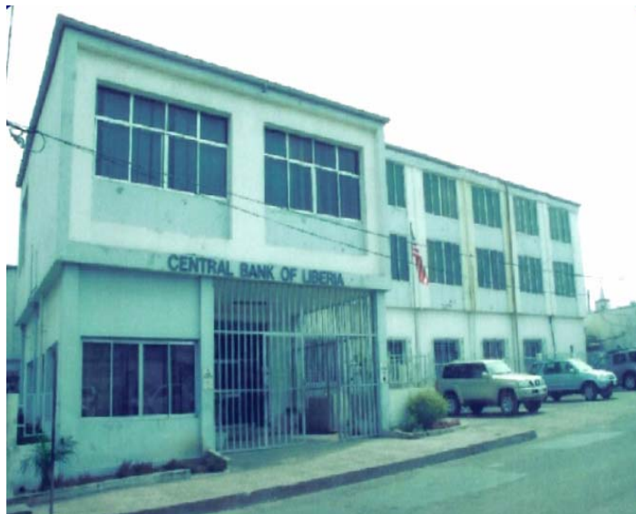
CENTRAL BANK OF LIBERIA

Corner of Warren and Carey Streets P. O. Box 2048, Monrovia Tel: 231-5-960557/5-960556 Fax:(231) 770-59642 Website: www.cbl.org.lr