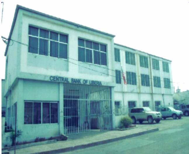
CENTRAL BANK OF LIBERIA