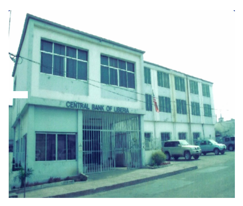
CENTRAL BANK OF LIBERIA